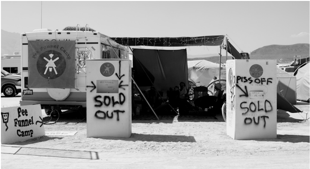
Going-out-of-business sale a success at the Pee Funnel camp.

Tornus and Zang are the two undisputed leaders and organizers (On to page 2)