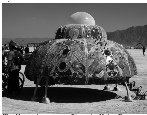
The Yes project saucer.

The flying saucer by the Man was decorated by art made by children from San Francisco's troubled neighborhoods. The saucer is covered with countless mosaic panels, each made by a different child.