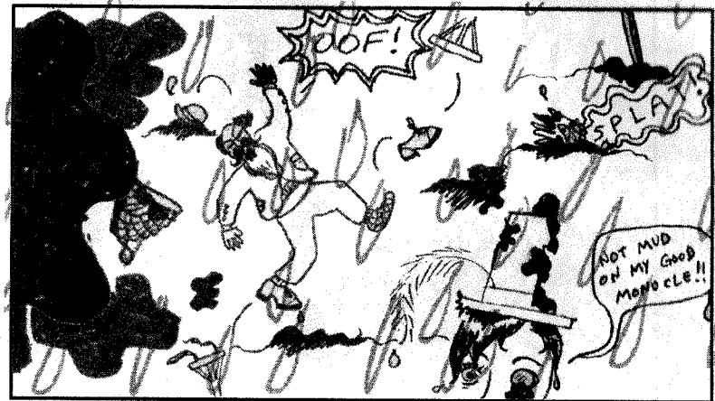
STELT CAMP IS CAUGHT UNAWARES ON THEIR WAY TO A BLACK TIE AFFAIR

The summit is being conducted at First Camp located behind Center Larry. Oh, and bring lube.